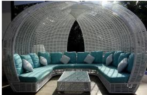
Outdoor Bar Lounge furniture