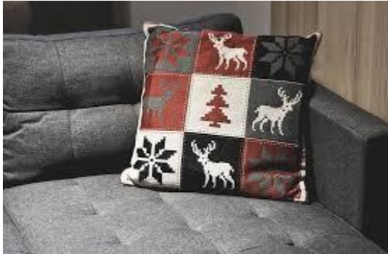
Sofa with pillow

(2) Upholstered furniture – speciality thread ideal for outdoor and heavy weight fabric